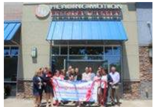
Healing Motion Physical Therapy June 30th