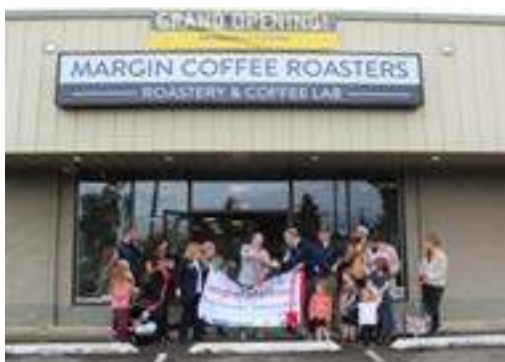
Margin Coffee's New Location June 10th