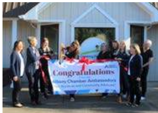
Creating Pathways Pediatric Therapy June 16th