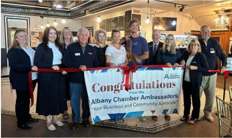
Beloved Cheesecakes September 15, 2023