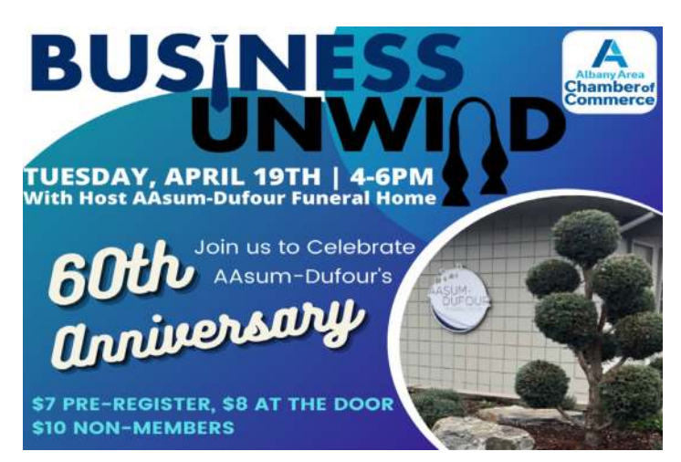
Read More About Chamber Events on Page 8

Read More About the Golf Tournament on Page 3